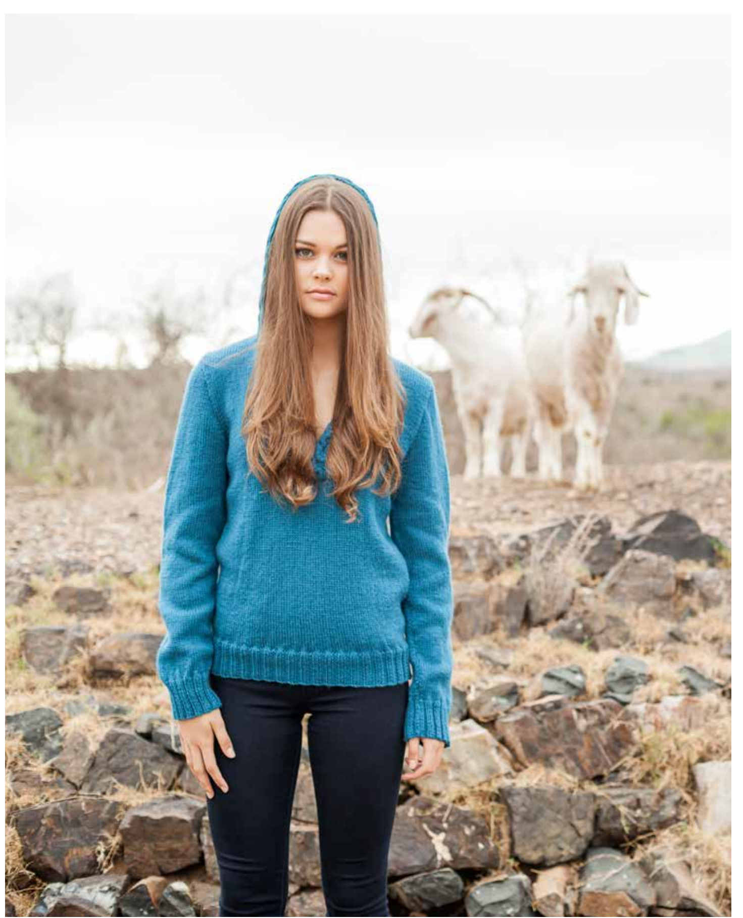
- WWW.AFRICANEXPRESSIONS.CO.ZA -